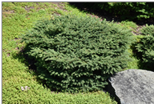
Birds Nest Spruce