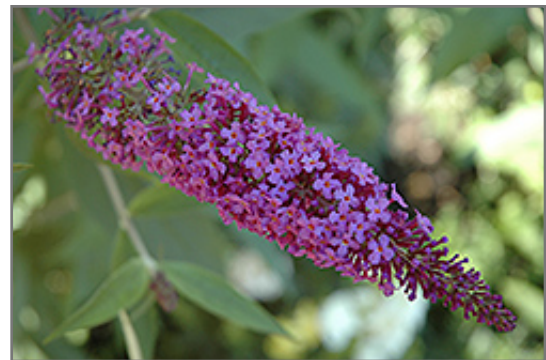
Flutterby Petite Blue Heaven Butterfly Bush flowers