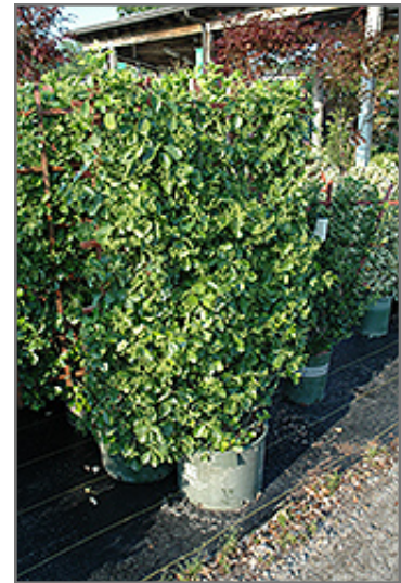
Manhattan Spreading Euonymus