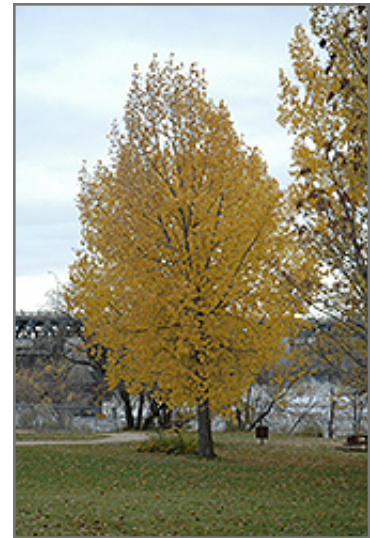
Siouxland Poplar in fall