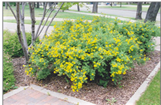
Coronation Triumph Potentilla in bloom