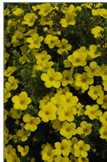
Gold Drop Potentilla flowers