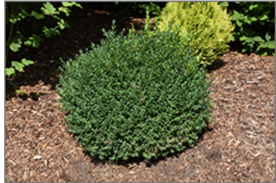
North Star Boxwood