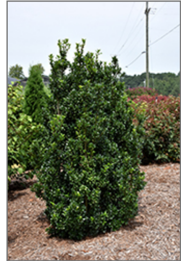
Castle Wall Meserve Holly

Castle Wall Meserve Holly is recommended for the following landscape applications;