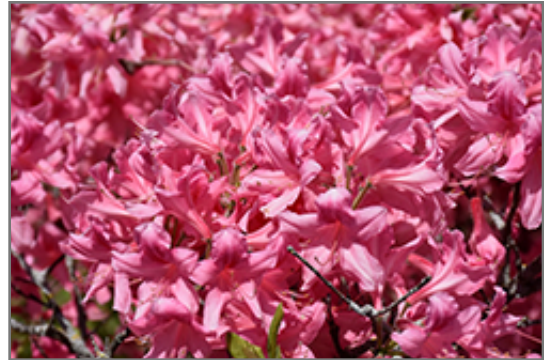
Rosy Lights Azalea flowers

Rosy Lights Azalea is recommended for the following landscape applications;