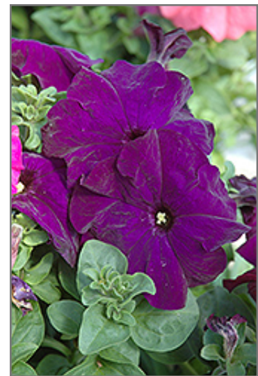
Dreams Midnight Petunia flowers