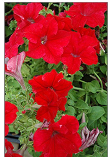
Dreams Red Petunia flowers