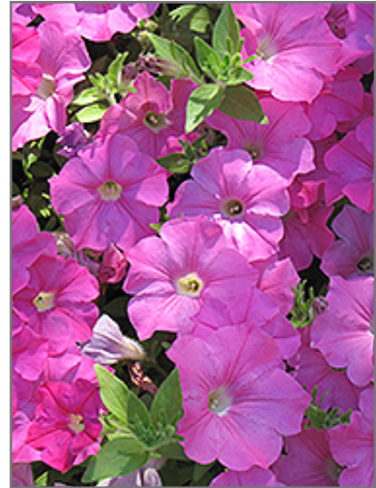
Easy Wave Pink Petunia flowers

Easy Wave Pink Petunia is a dense herbaceous annual with a trailing habit of growth, eventually spilling over the edges of hanging baskets and containers. Its medium texture blends into the garden, but can always be balanced by a couple of finer or coarser plants for an effective composition.