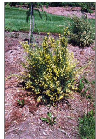
Scotch Broom in bloom