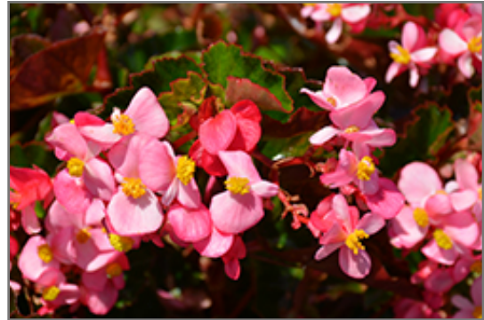
BabyWing Pink Begonia flowers

This is a high maintenance plant that will require regular care and upkeep, and usually looks its best without pruning, although it will tolerate pruning. Deer don't particularly care for this plant and will usually leave it alone in favor of tastier treats. Gardeners should be aware of the following characteristic(s) that may warrant special consideration;