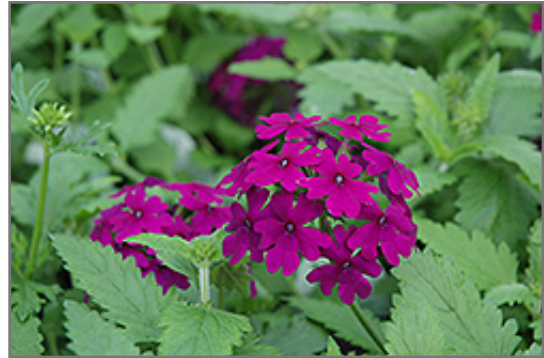
Superbena Purple Verbena flowers

Superbena Purple Verbena is recommended for the following landscape applications;