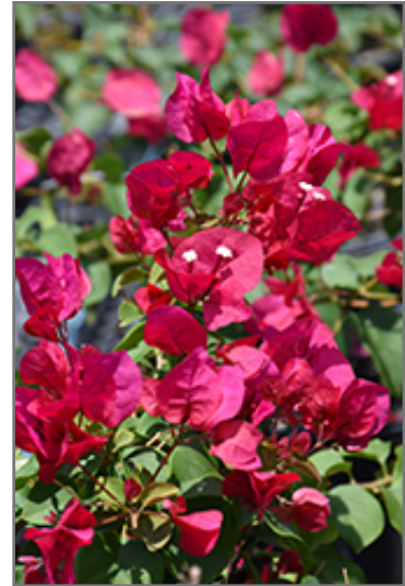
Barbara Karst Bougainvillea flowers