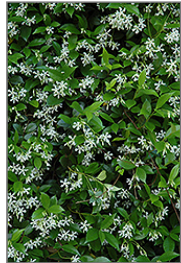
Confederate Star-Jasmine flowers