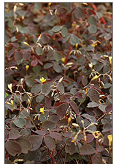
Burgundy Bliss Shamrock flowers