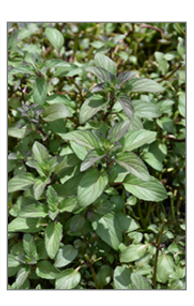
Water Mint foliage

Aside from its primary use as an edible, Water Mint is sutiable for the following landscape applications;