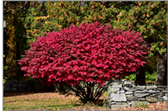
Winged Burning Bush in fall

Winged Burning Bush is recommended for the following landscape applications;