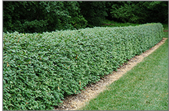
Winged Burning Bush

This shrub performs well in both full sun and full shade. It is very adaptable to both dry and moist locations, and should do just fine under average home landscape conditions. It is not particular as to soil type or pH. It is highly tolerant of urban pollution and will even thrive in inner city environments. This species is not originally from North America.