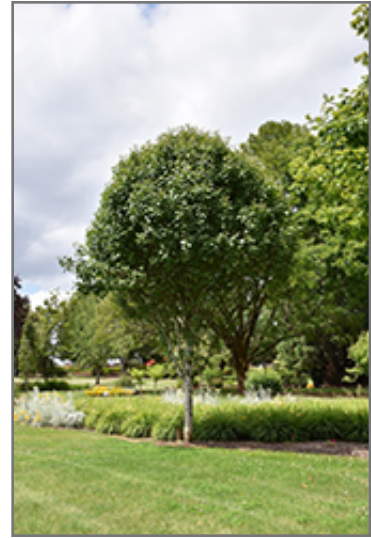
Jack Ornamental Pear

This tree should only be grown in full sunlight. It prefers to grow in average to moist conditions, and shouldn't be allowed to dry out. It is not particular as to soil type or pH. It is highly tolerant of urban pollution and will even thrive in inner city environments. This is a selected variety of a species not originally from North America.