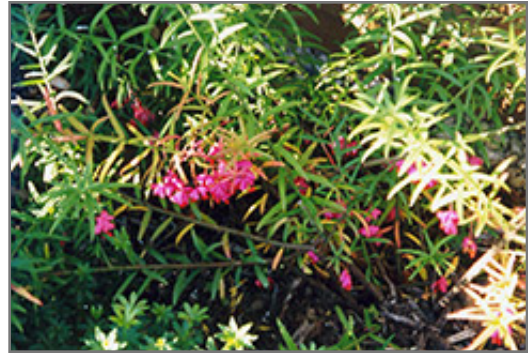
Dwarf Turkestan Burning Bush flowers

This shrub performs well in both full sun and full shade. It is very adaptable to both dry and moist locations, and should do just fine under typical garden conditions. It is not particular as to soil type or pH. It is highly tolerant of urban pollution and will even thrive in inner city environments. This is a selected variety of a species not originally from North America.