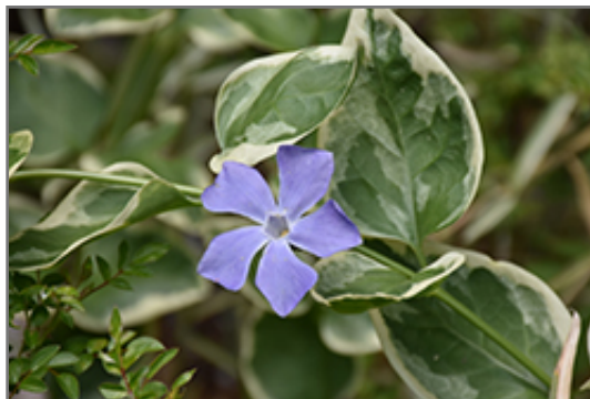
Variegated Periwinkle flowers