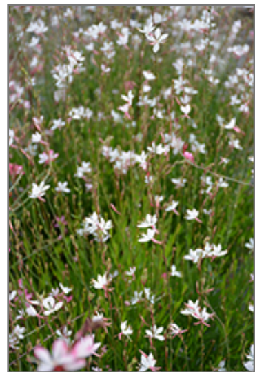
Ballerina White Gaura in bloom