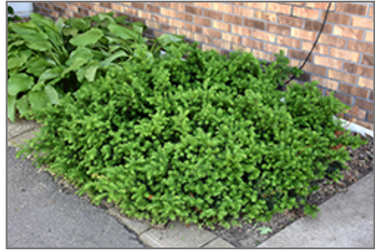
Emerald Spreader Yew

This shrub performs well in both full sun and full shade. However, you may want to keep it away from hot, dry locations that receive direct afternoon sun or which get reflected sunlight, such as against the south side of a white wall. It does best in average to evenly moist conditions, but will not tolerate standing water. It is not particular as to soil type or pH. It is highly tolerant of urban pollution and will even thrive in inner city environments, and will benefit from being planted in a relatively sheltered location. Consider applying a thick mulch around the root zone in winter to protect it in exposed locations or colder microclimates. This is a selected variety of a species not originally from North America, and parts of it are known to be toxic to humans and animals, so care should be exercised in planting it around children and pets.