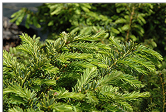
Emerald Spreader Yew foliage