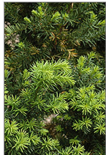
Hicks Yew foliage