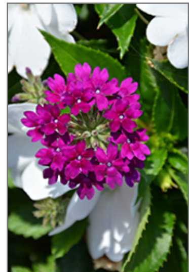
Superbena Royale Plum Wine Verbena flowers