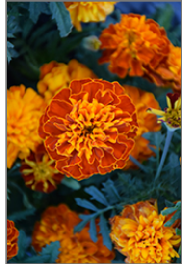
Bonanza Harmony Marigold flowers