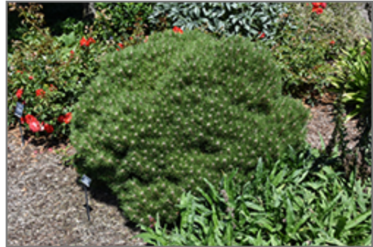
Bambino Dwarf Austrian Pine