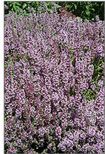
Mother-of-Thyme in bloom

This plant will require occasional maintenance and upkeep, and is best cleaned up in early spring before it resumes active growth for the season. Deer don't particularly care for this plant and will usually leave it alone in favor of tastier treats. Gardeners should be aware of the following characteristic(s) that may warrant special consideration;