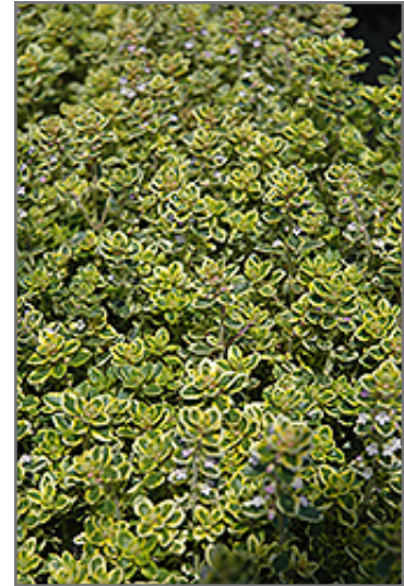
Lemon Thyme foliage

Lemon Thyme is smothered in stunning spikes of lilac purple flowers rising above the foliage from early to late summer. Its attractive tiny fragrant round leaves remain light green in color throughout the year.