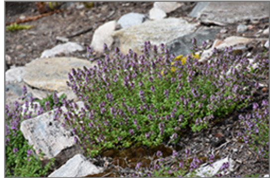
Lemon Thyme in bloom

This plant is quite ornamental as well as edible, and is as much at home in a landscape or flower garden as it is in a designated herb garden. It should only be grown in full sunlight. It prefers to grow in average to dry locations, and dislikes excessive moisture. It is considered to be drought-tolerant, and thus makes an ideal choice for a low-water garden or xeriscape application. It is not particular as to soil type or pH. It is highly tolerant of urban pollution and will even thrive in inner city environments. Consider covering it with a thick layer of mulch in winter to protect it in exposed locations or colder microclimates. This particular variety is an interspecific hybrid. It can be propagated by division; however, as a cultivated variety, be aware that it may be subject to certain restrictions or prohibitions on propagation.