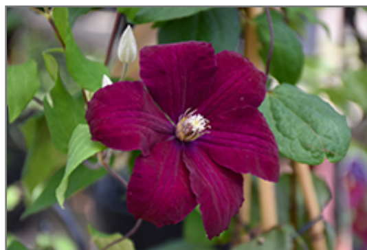
Rouge Cardinal Clematis flowers