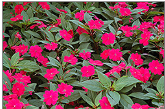
Bounce Cherry Impatiens in bloom