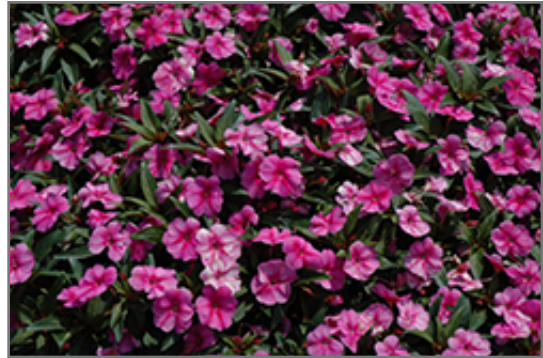
Bounce Pink Flame Impatiens flowers

Bounce Pink Flame Impatiens is recommended for the following landscape applications;