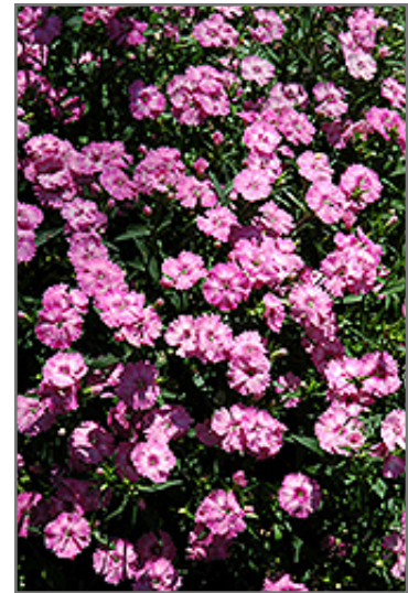
Blue Hills Pinks flowers

Blue Hills Pinks is recommended for the following landscape applications;