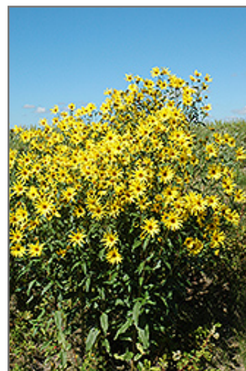
False Sunflower in bloom