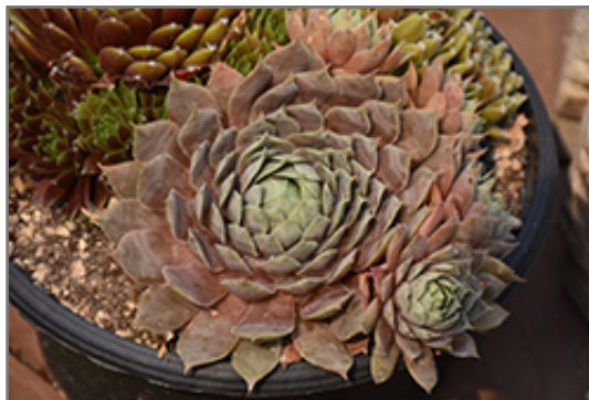
Chick Charms Berry Blues Hens And Chicks