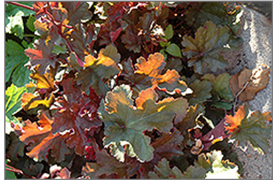
Chocolate Ruffles Coral Bells foliage

* This is a 'special order' plant - contact store for details