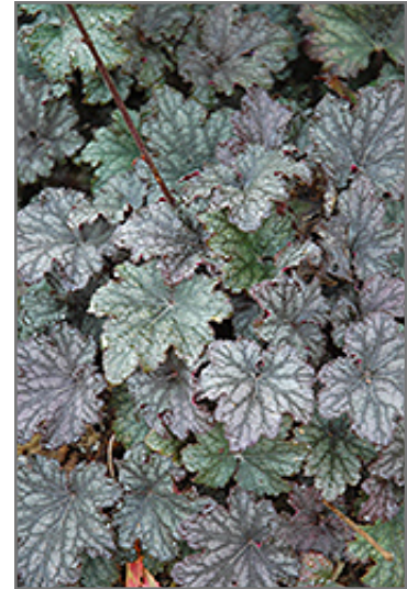
Frosted Violet Coral Bells foliage

This is a relatively low maintenance plant, and should be cut back in late fall in preparation for winter. It is a good choice for attracting hummingbirds to your yard. It has no significant negative characteristics.