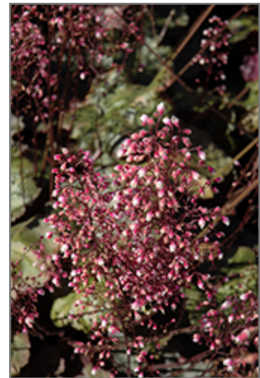
Frosted Violet Coral Bells flowers