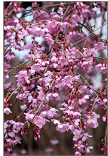
Pink Cascade Weeping Cherry flowers

Pink Cascade Weeping Cherry is recommended for the following landscape applications;