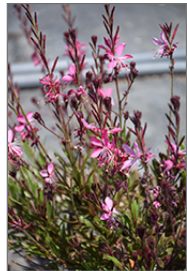
Whiskers Deep Rose Gaura flowers