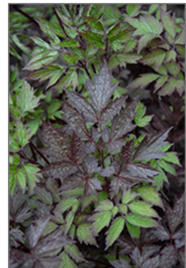
Black Negligee Bugbane foliage