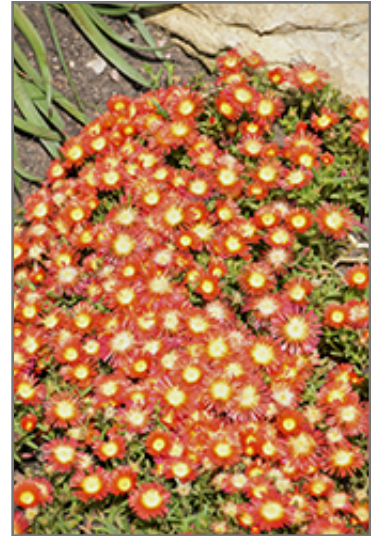
Delmara Red Ice Plant

This is a relatively low maintenance plant, and is best cleaned up in early spring before it resumes active growth for the season. It is a good choice for attracting bees and butterflies to your yard. It has no significant negative characteristics.