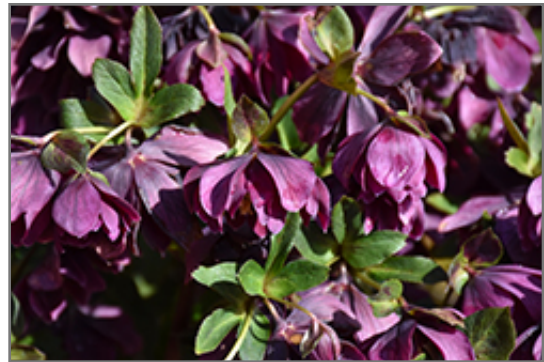
Winter Jewels Amethyst Gem Hellebore flowers

Winter Jewels Amethyst Gem Hellebore is recommended for the following landscape applications;