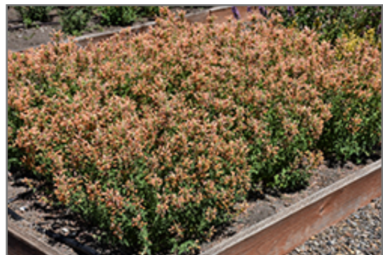
Kudos Gold Hyssop in bloom