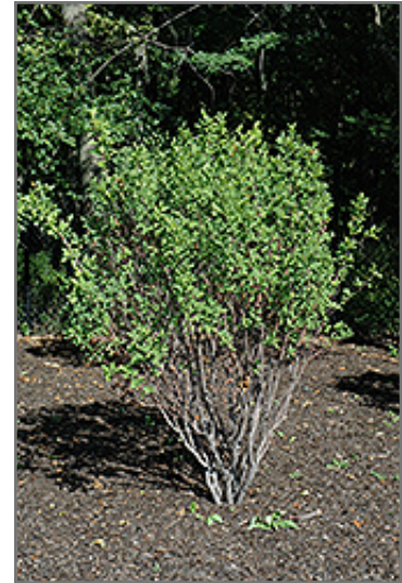
Rainbow Pillar Serviceberry

Rainbow Pillar Serviceberry is a dense multi-stemmed deciduous shrub with a narrowly upright and columnar growth habit. Its relatively fine texture sets it apart from other landscape plants with less refined foliage.