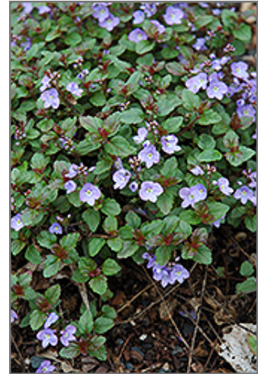
Waterperry Blue Speedwell in bloom