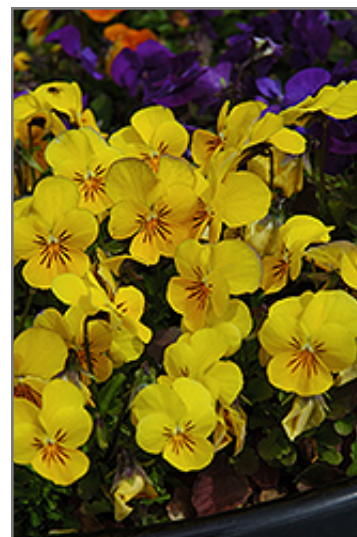
Penny Yellow Pansy flowers

This plant will require occasional maintenance and upkeep, and should only be pruned after flowering to avoid removing any of the current season's flowers. Deer don't particularly care for this plant and will usually leave it alone in favor of tastier treats. Gardeners should be aware of the following characteristic(s) that may warrant special consideration;