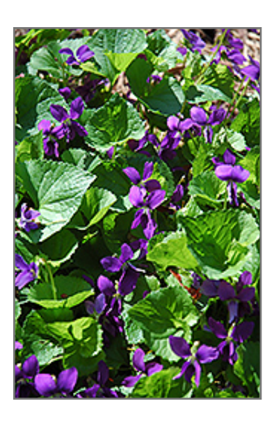
Blue Marsh Violet flowers