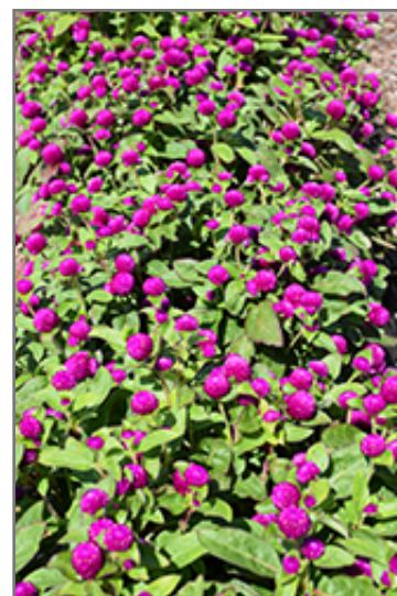
Gnome Purple Gomphrena in bloom